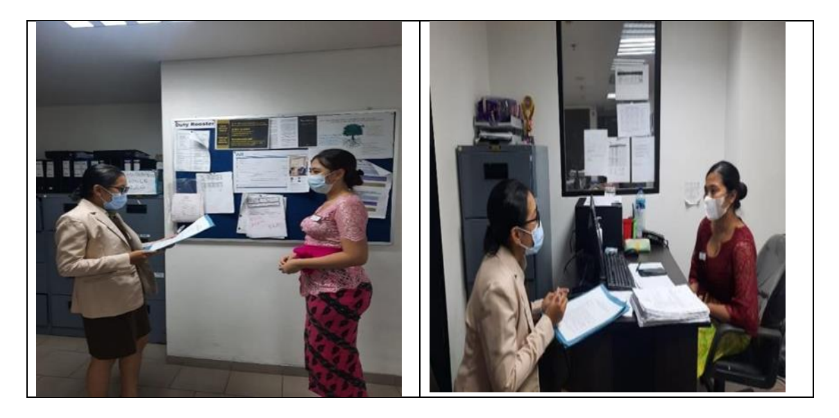
Figure 3. The process of collecting data

the researcher and is deemed able to provide information, then he or she can be used as a sample—data collects collected on guests who stay or have received front office department services and at Mercurli Legian. The sample used in this study was 68 respondents with a minimum sample determination calculated using the Malholtra formula, which implies the number of variable indicators by 4 (Indrawan & Yaniawati, 2016).