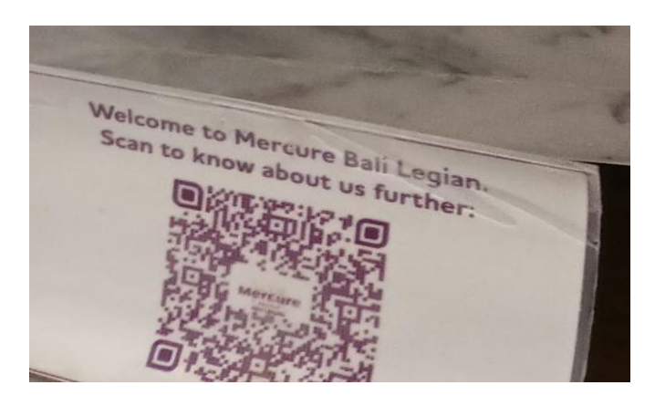
Figure 5. Paperless Action in Mercure Bali Legian

Based on the interview results above, it is known that the form of business carried out by the front office department in supporting the implementation of green action starts from doing basic things such as reducing the use of paper or paperless. For example, backup data from guest reservations are added directly to the system without using a print-out of reservation correspondence like in previous years.