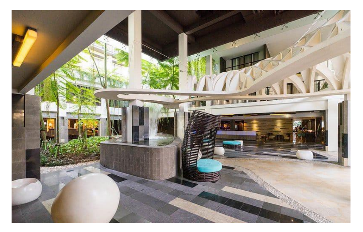
Figure 1. Front Office of Mercure Bali Legian

According to Parasuraman et al. (Suparno Saputra, 2019) s, service quality can be seen from the five existing dimensions, including: